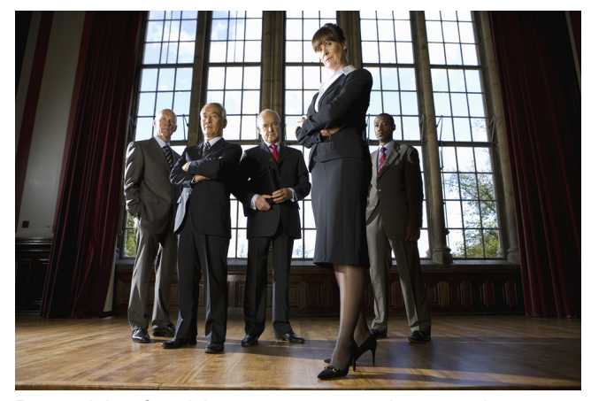
Research has found that women are superior to men in most ways that will count in the future.

Male biology has brought the world war, corruption and scandal. Women are poised to lead us to a better place